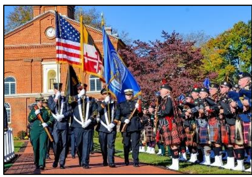
The various Fire Department pipes & drums play the Color and Honor Guards into the Honor ceremony on Sunday, 9 Oct 2022.