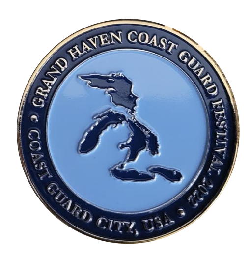
Medallion present to USCGPB members prior to Festival parade.