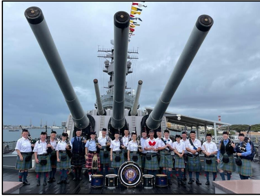
Ceremony Pipe and Drum band members from Honolulu on the main desk of the USS MISSOURI.