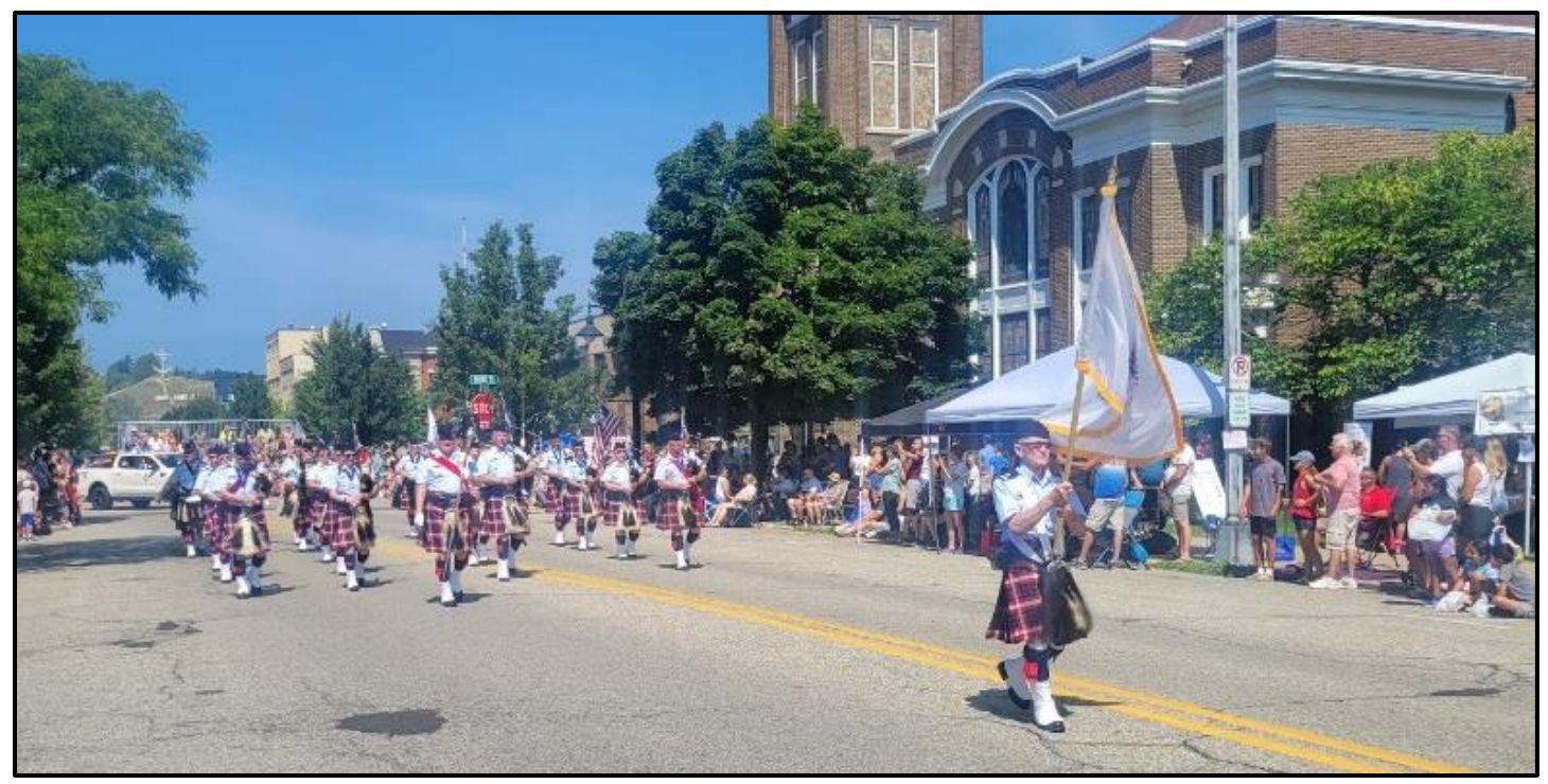
On the march heading up the hill to the Reviewing Stand.