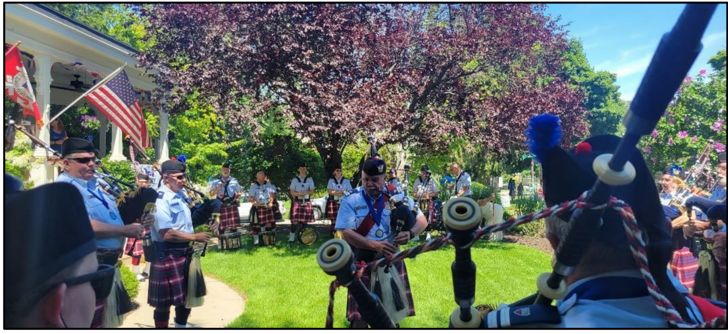
A great end to a great couple of days in Grand Haven...the Boyden House final performances before concluding the 20<sup>th</sup> year of the U.S. Coast Guard Pipe Band participation at the Grand Haven Coast Guard Festival.